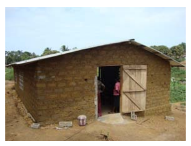
New Life Bible Church built within the last six months.

The next week, on Monday, we went sightseeing in Monrovia, going by the United States Embassy, visiting some higher up officials with the University of Liberia and also those at the United Methodist University, even having an audience with the president of the university, a fine Christian gentleman.