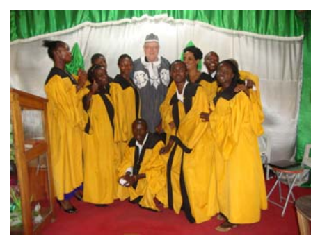
The Kingdom Focus Evangelistic Church Choir